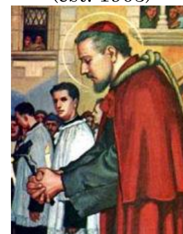
November 4 Patron of Seminarians and Catechists

Oh God, Maintain in your people that spirit with which you inspired your Bishop St. Charles, so that your church may be constantly renewed, conforming itself to Christ and manifesting Christ to the world.